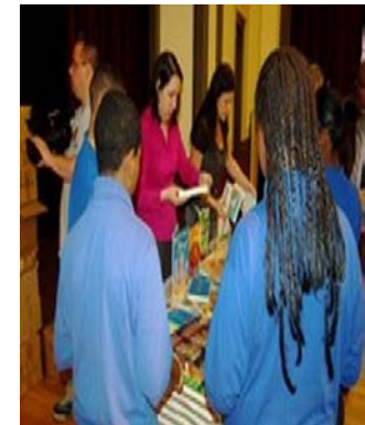
Children from School #31 picking out books to take home with them. Project Flight stresses the importance of children having books in the home.