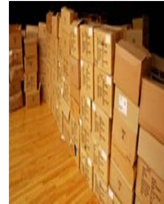
Seen here is a larger portion of the 32,950 books Project Flight donated to the Buffalo Public School #31 at an estimated cost of $228,389.00.