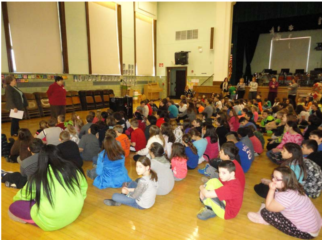
John T. Waugh School receives books for their library and students.