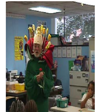
Now the children have a real flower to put his costume into perspective.