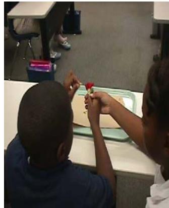
Children pick apart the flower seeing first hand how the components of a flower work together.